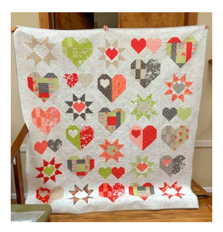
"Heart-Felt" can be yours!

Someone willing to give $500 for this beautiful "Heart-Felt" quilt below. Proceeds to benefit HCWC. Queen size, 75.5" x 82".